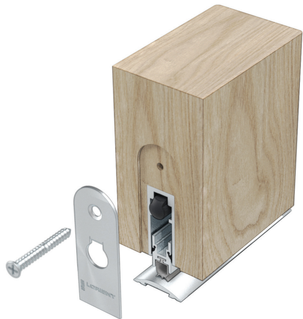
LAS8001 si (shown with LAS4001)